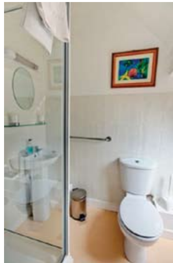
"En-suite in Family Room"