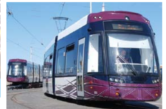
"New Trams - Easter 2012"