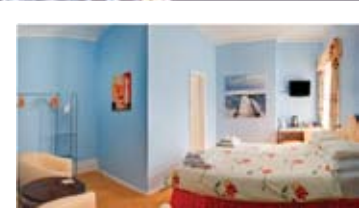
"Deluxe Double Room"