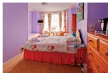
"Family Twin/Luxury Double"