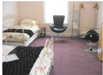
"Luxury Room with Laura Ashley Beds"